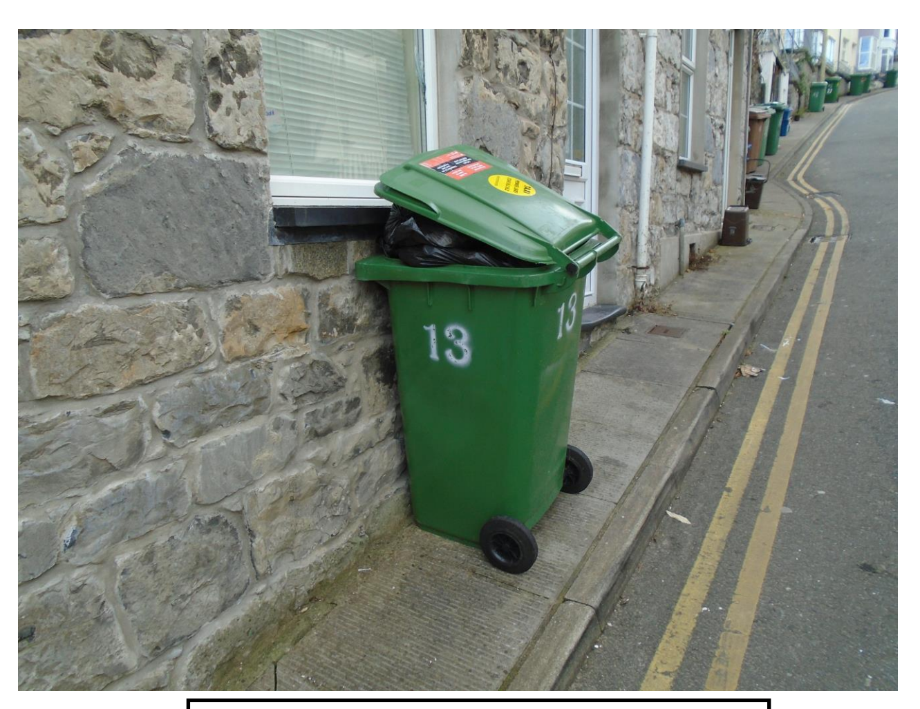
Bins out on quiet residential back lanes